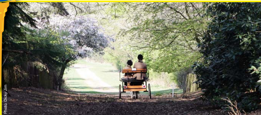
A mother and daughter enjoying a peaceful drive in the countryside at the Windsor Sponsored Drive last year. It has been decided that there will not be a sponsored drive in Windsor Great Park in 2008.

Book your classified adverts on line: www.carriage-driving.com